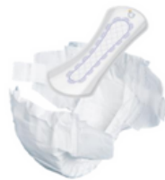
eBrief™ Sensor Insert Applied to brief or pull-up