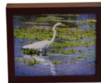
Room Reader Detects incontinence event